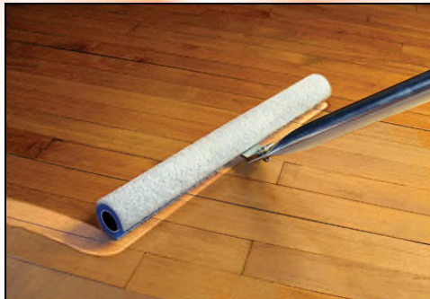
PADCO T-Bar Floor Coater and Refills