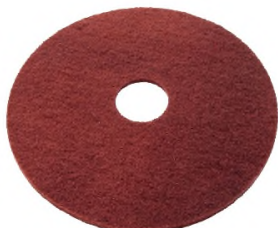
SSS Eco1000 Maroon Strip-Prep Pad