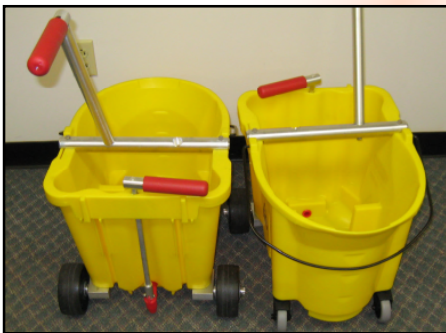
Finish Application Bucket

Equipment for best results, efficiency and ease of application.