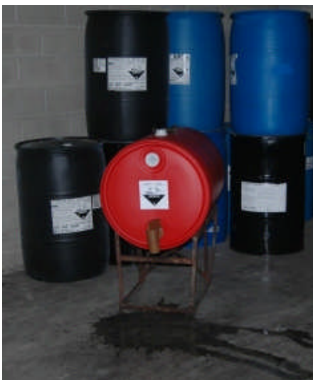
Eliminate hazardous spills and the clutter of hazardous, residue-containing drums.