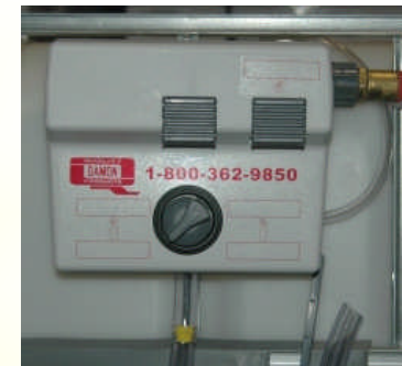
Optional multi-dilution equipment available